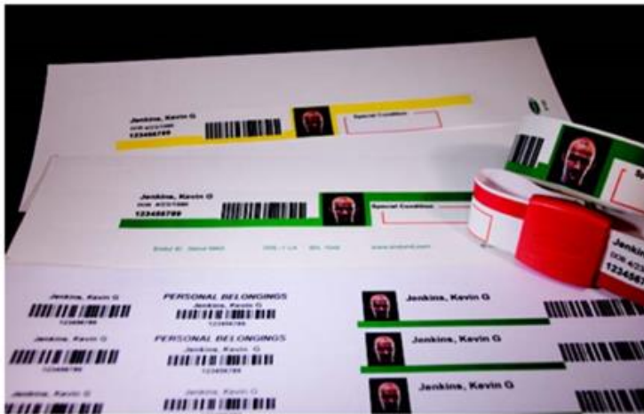
Example of printed wristband with labels